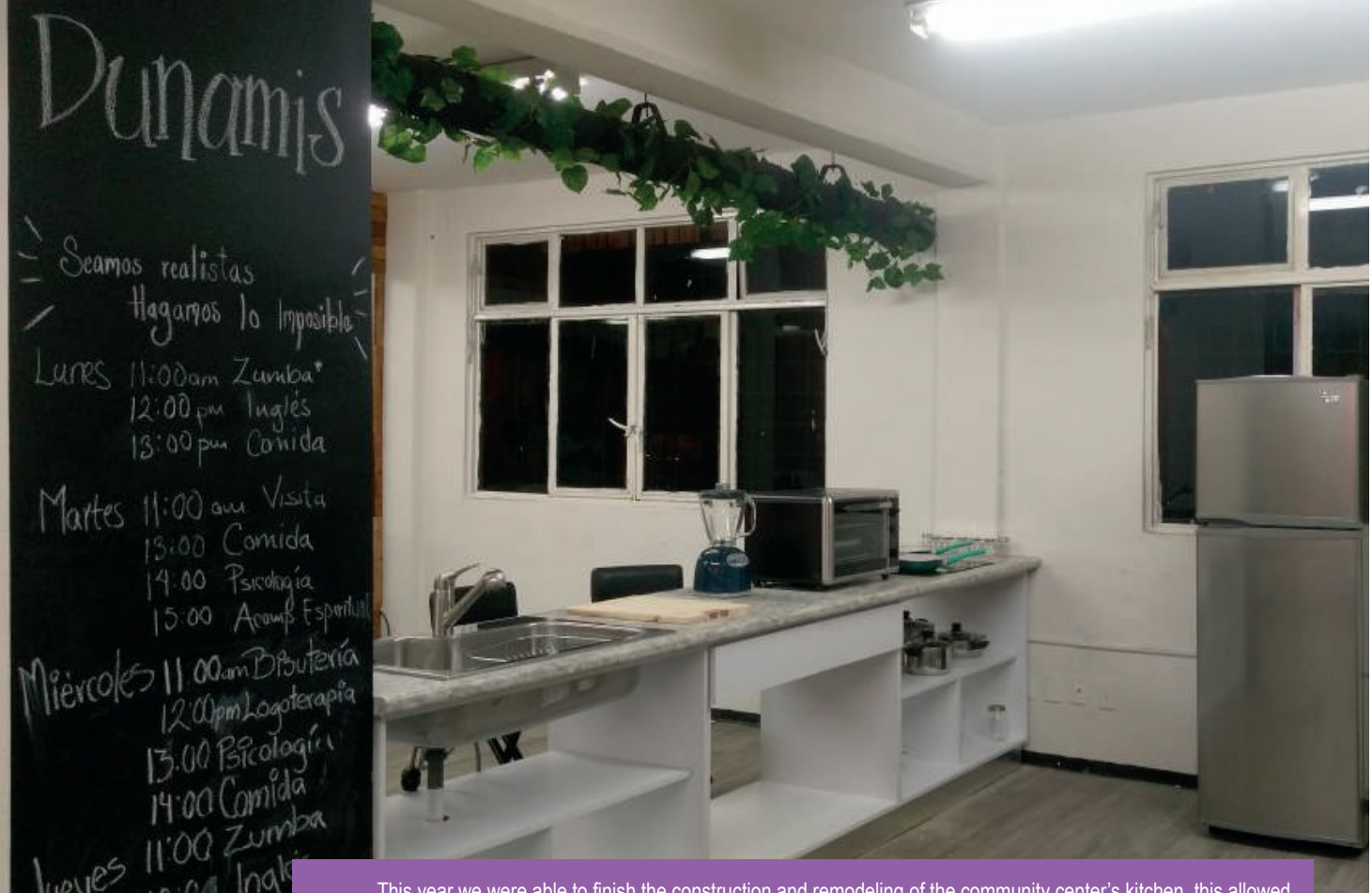
This year we were able to finish the construction and remodeling of the community center's kitchen, this allowed us to expand the variety of workshops, provide new services and create deeper bonds with our community.

The girls can discover and develop their abilities with the purpose of leaving prostitution. They take english classes, cooking and baking as well as finding someone to walk with them.